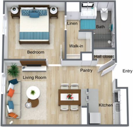
One Bedroom, One Bath