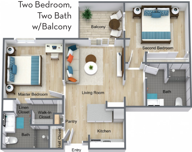
Two Bedroom, Two Bath w/Balcony