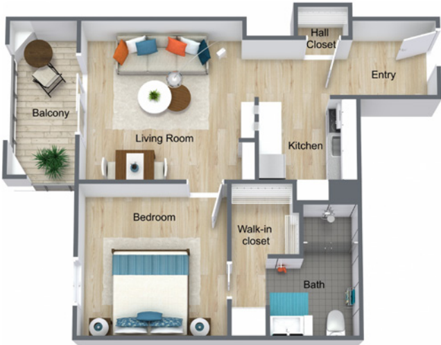
One Bedroom, One Bath w/Balcony