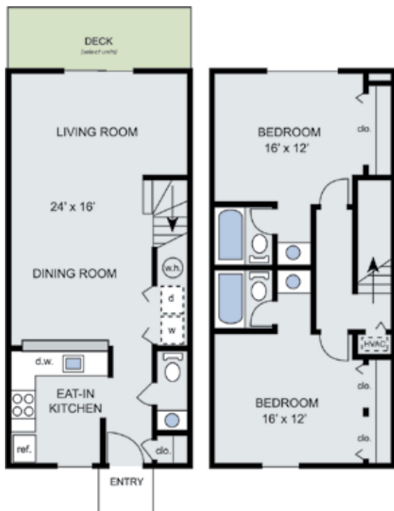
The Elm 2 Bedroom 2.5 Bath 1120 sq ft