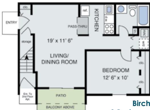
Birch 1 Bedroom 1 Bath 644 sq ft