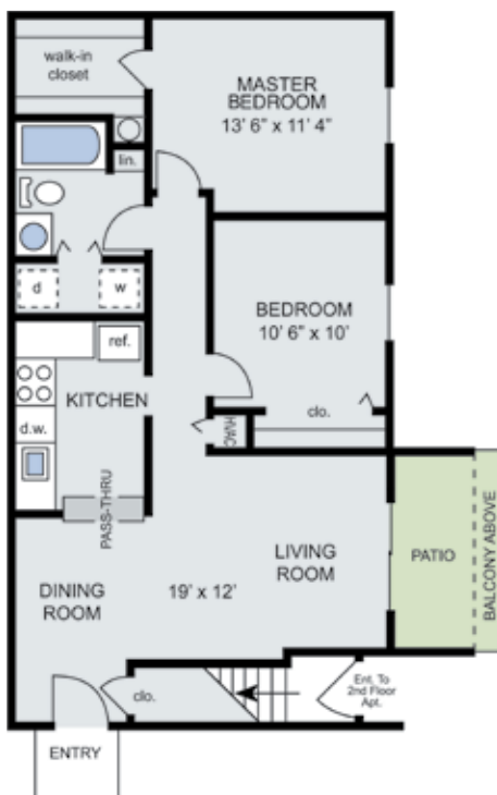
Cedar 2 Bedroom 1 Bath 852 sq ft