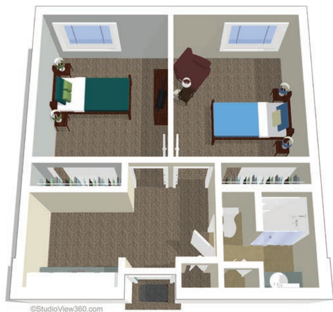
Memory Care Companion Suite 650 square feet