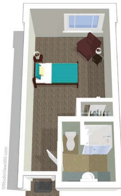
Memory Care Studio 377 square feet