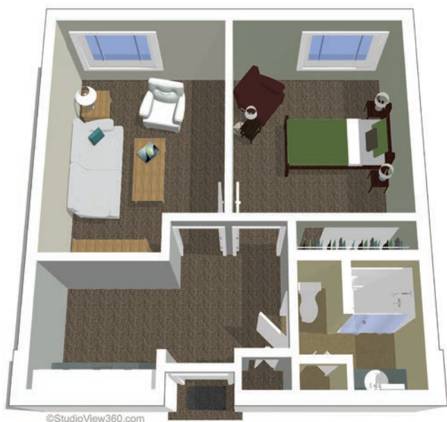
Assisted Living One Bedroom 650 square feet