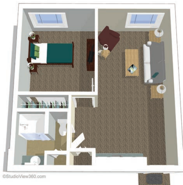
Assisted Living Grand Suite 650 square feet