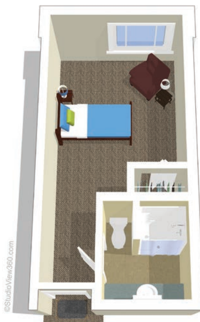
Assisted Living Studio 377 square feet