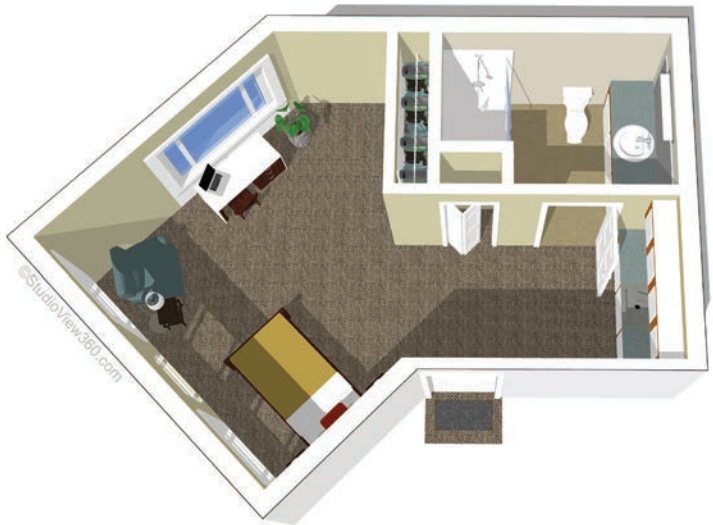
Assisted Living Studio Suite One 381 square feet