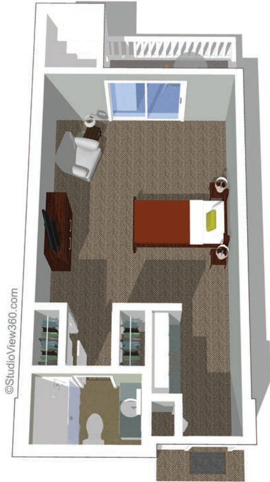
Assisted Living Studio Suite Three 392 square feet