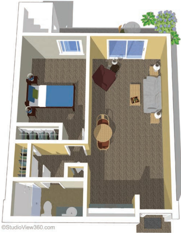
Assisted Living One Bedroom 605 square feet