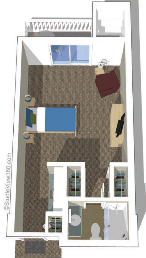
Memory Care Studio 392 square feet