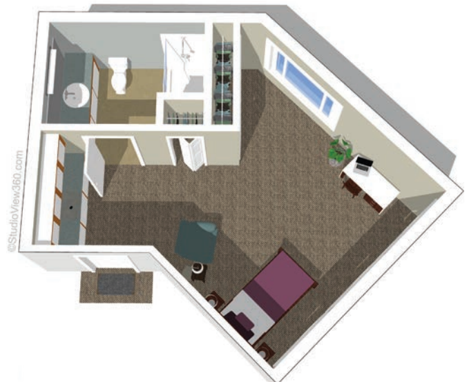
Assisted Living Studio Suite Two 355 square feet