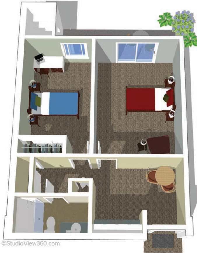
Memory Care Companion Suite 650 square feet