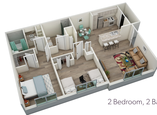
2 Bedroom, 2 Bath