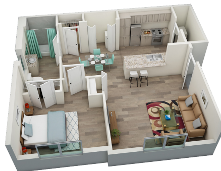
1 Bedroom, 1 Bath

Spacious one, two and three bedroom apartment homes