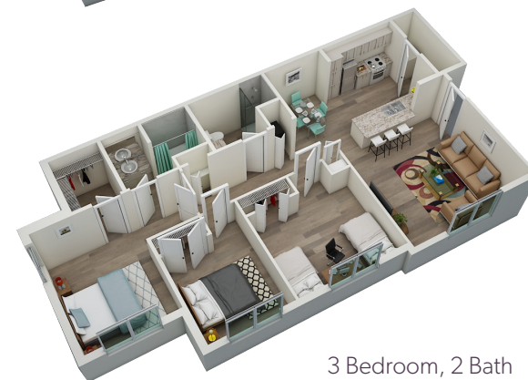
3 Bedroom, 2 Bath