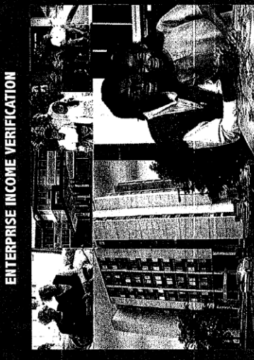
ENTERPRISE INCOME VERIFICATION

What YOU Should Know if You are Applying for or are Receiving Rental Assistance through the Department of Housing and Urban Development (HUD)