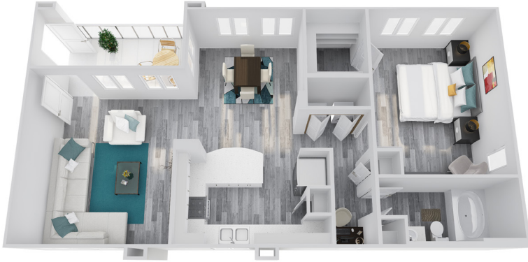
COYOTE 1B 1B · 996 SQ