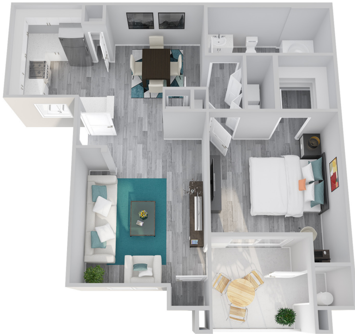
CARDINAL 1B 1B · 858 SQ