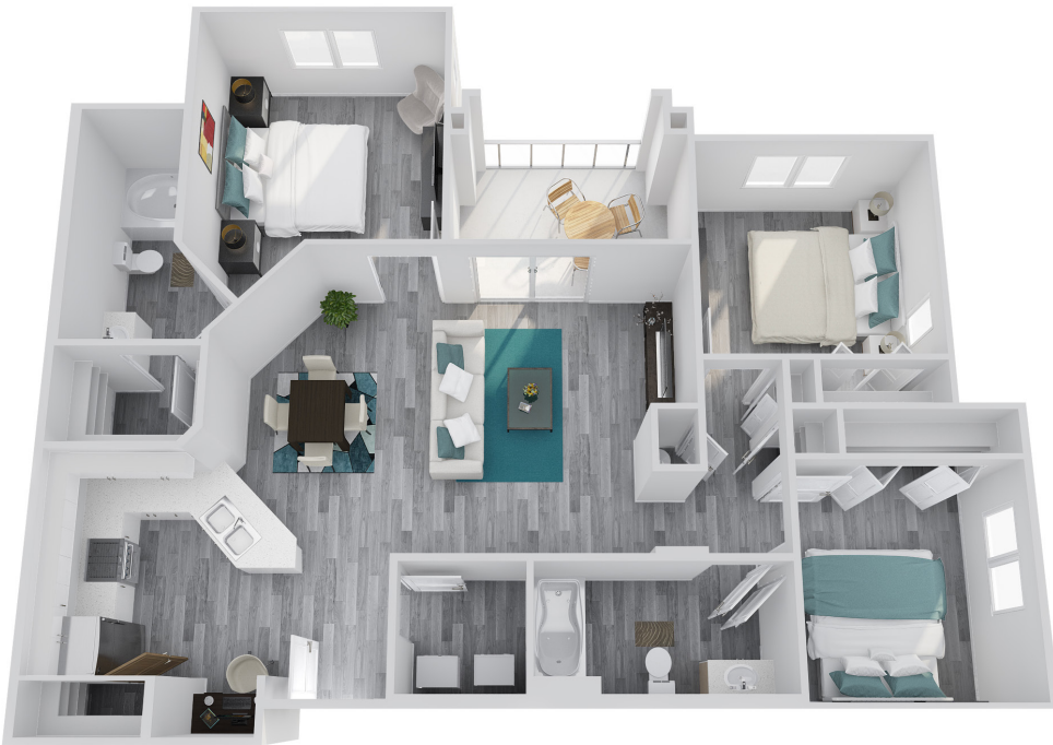
WILDCAT 3B 2B · 1,303 SQ

*Floor plans are artist's rendering. All dimensions are approximate. Actual product and specifications may vary in dimension or detail. Not all features are available in every rental home. Prices and availability are subject to change. Please see a representative for details.