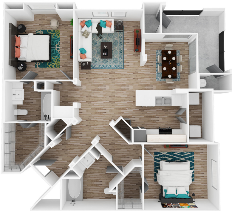
FORCE 2B 2B · 1184 SQ