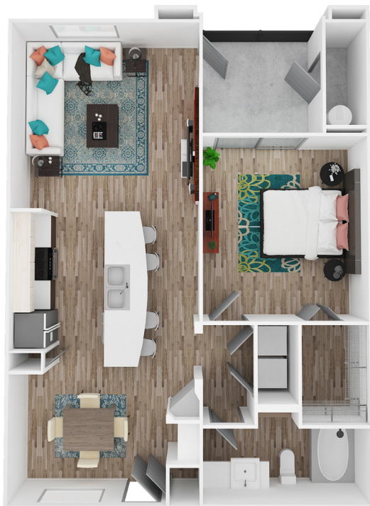
ZEN 1B 1B · 810 SQ