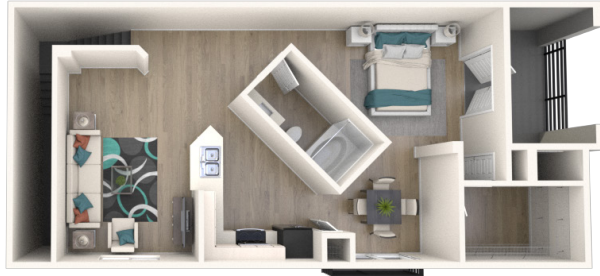
BALANCE STUDIO 1B · 852 SQ