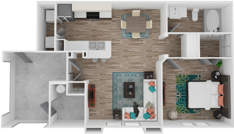
ENERGY 1B 1B · 710 SQ