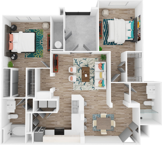
STAMINA 2B 2B · 1141 SQ