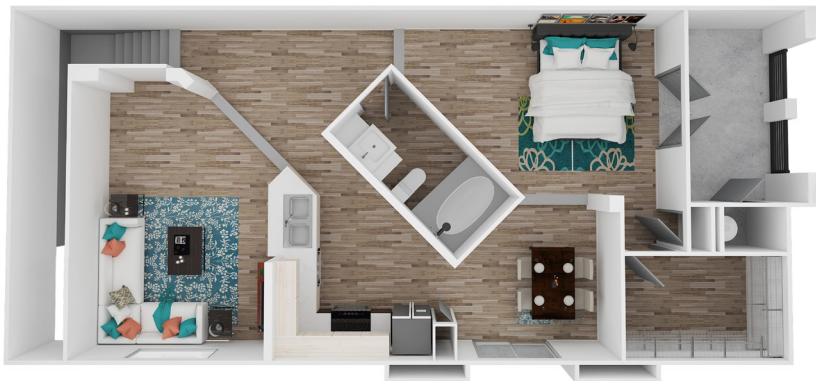
BALANCE STUDIO 1B · 852 SQ