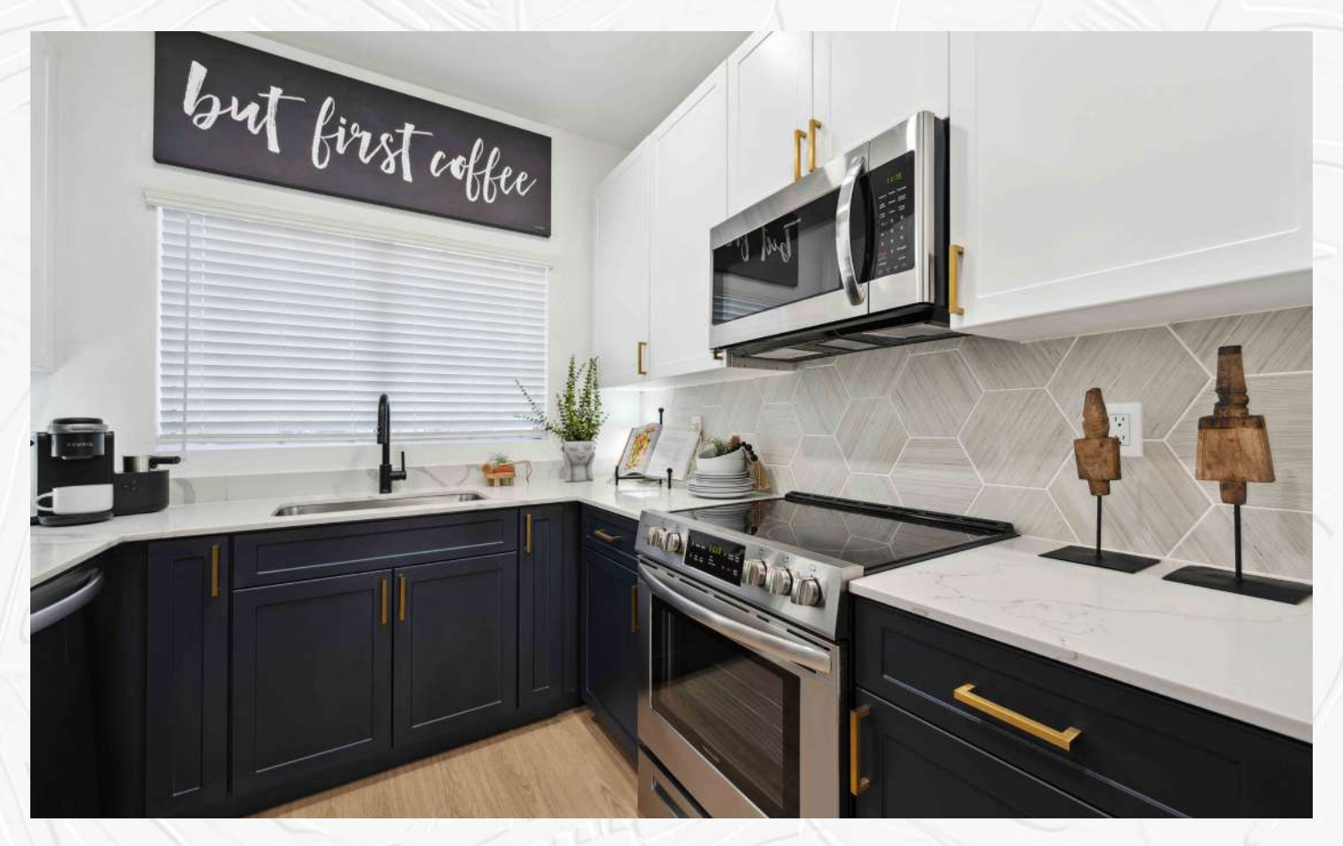
Discover the luxury of our open-concept one-, two-, and three-bedroom floor plans, here at Hideaway North Scottsdale