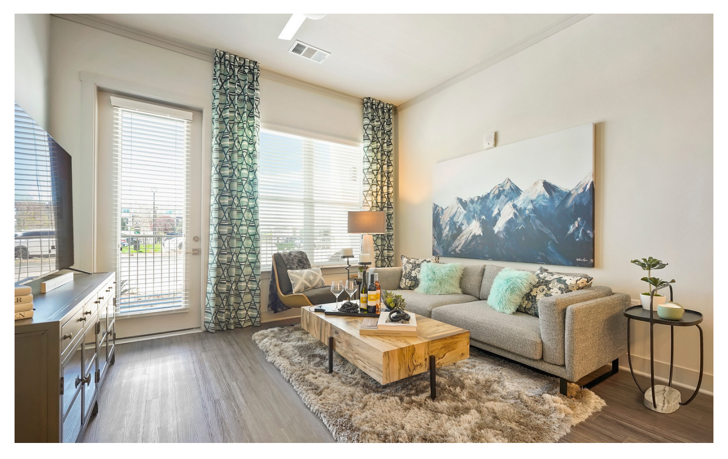
Discover the luxury of our open-concept one-, two-, and three-bedroom floor plans, here at The Mezz at Fiddler's Green