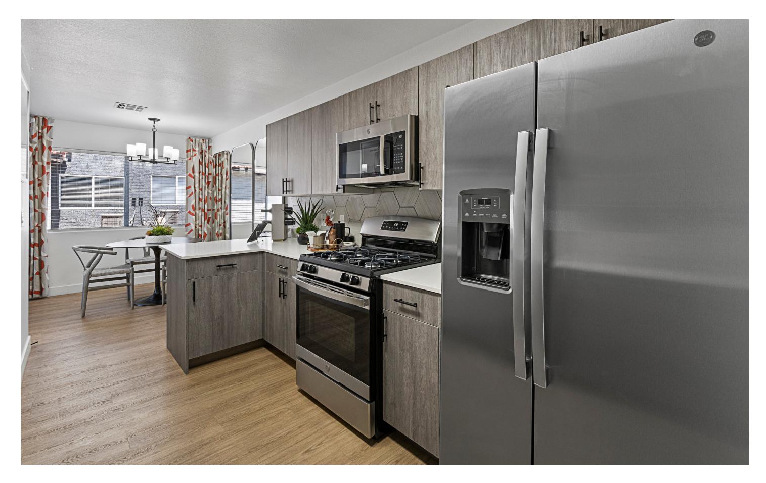
Discover the luxury of our open-concept two- and three-bedroom floor plans, here at The Townhomes at Horizon Ridge.