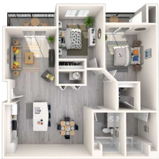
*Detached Garage Available on Select Homes