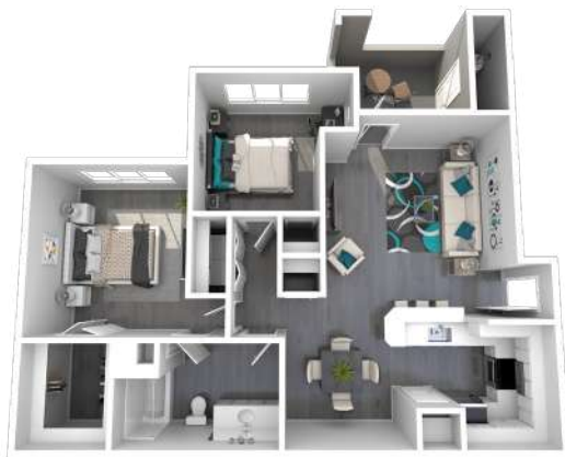
EDWARDS 2B 1B · 893 SQ

*Floor plans are artist's rendering. All dimensions are approximate. Actual product and specifications may vary in dimension or detail. Not all features are available in every rental home. Prices and availability are subject to change. Please see a representative for details.