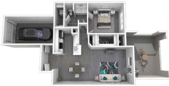
DOBSON W/ GARAGE 1B 1B · 796 SQ