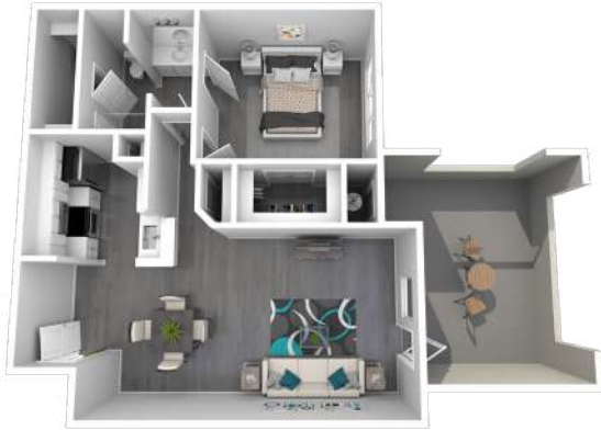
DOBSON 1B 1B · 796 SQ