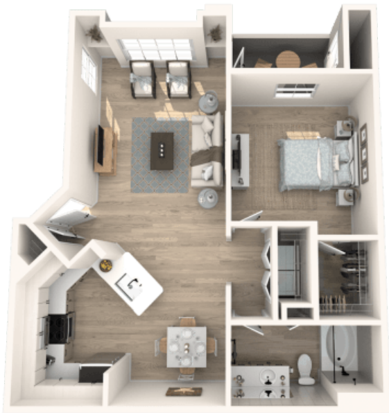
THE FLAIR 1B 1B · 757 SQ

*Floor plans are artist's rendering. All dimensions are approximate. Actual product and specifications may vary in dimension or detail. Not all features are available in every rental home. Prices and availability are subject to change. Please see a representative for details.