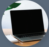
Professional Business Center