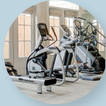
Fitness center with Fitnessondemand™ Studio