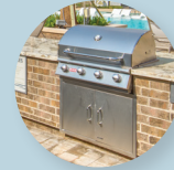
Outdoor kitchen and grilling stations