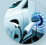
Car charging stations