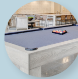
Clubhouse with bar, lounge, kitchen, and billiards