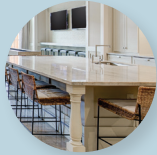
Library and computer lounge