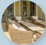
Outdoor living room