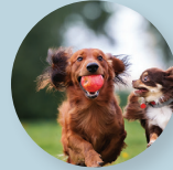
Dog spa and gated dual dog park