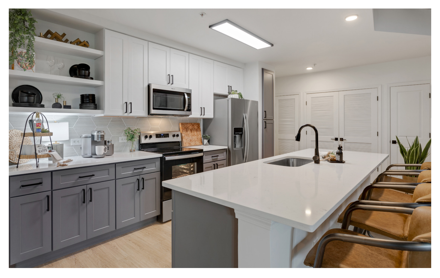
Discover the luxury of our open-concept one- and two-bedroom floor plans, here at Elliston 23.