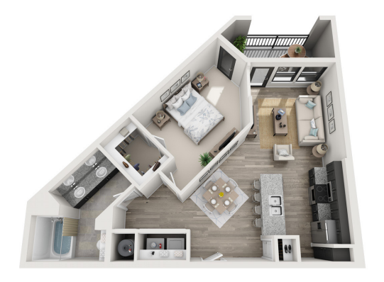
Renderings are an artist's conception and are intended only as a general reference. Features, materials, finishes and layout of subject unit may be different than shown. 3DPlans.com