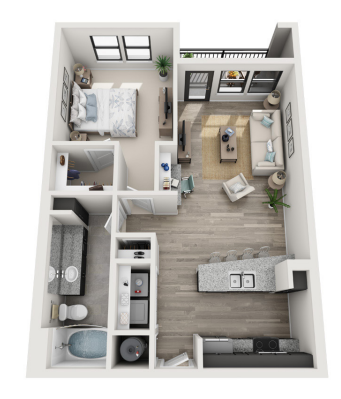
Renderings are an artist's conception and are intended only as a general reference. Features, materials, finishes and layout of subject unit may be different than shown. 3DPlans.com