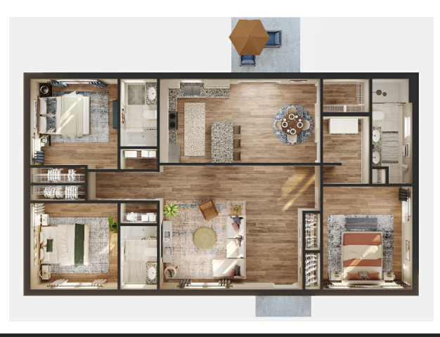
THE PALMER 3 BED | 3 BATH 1,508 SF