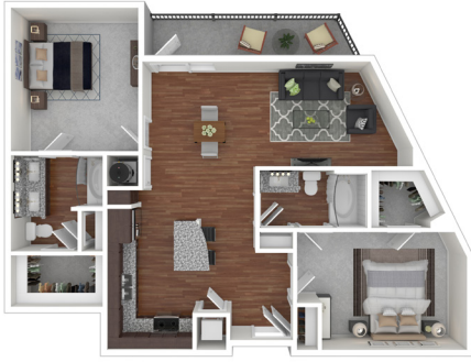
B10 2B 2B · 1079 SQ