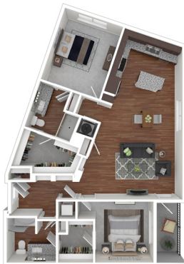
B12 2B 2B · 1179 SQ

Renderings are intended only as a general reference. Features, materials, finishes and layout of unit may be different than shown.