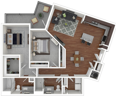
B11 2B 2B · 1178 SQ