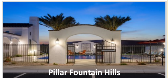
Pillar Fountain Hills