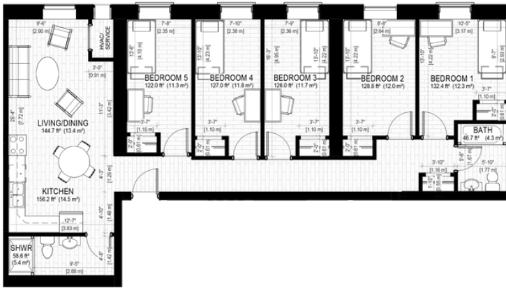
Suite 403 1333 ft² (123.9 m²)*