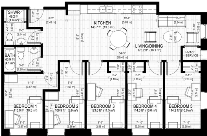
Suite 401 1131 ft² (105.1 m²)*