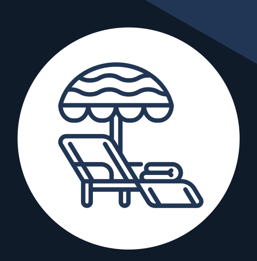
NEW POOL FURNITURE