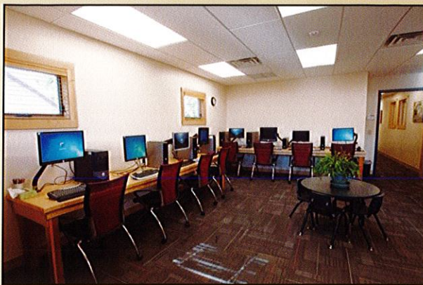
CGA Computer Lab