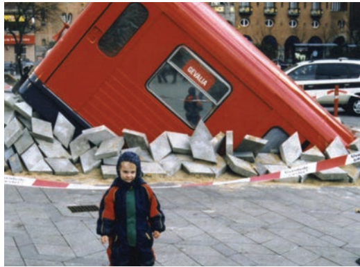
An April Fool's Day prank marking the construction of the Copenhagen Metro in 2001

Jokesters often expose their actions by shouting "April Fools!" at the recipient. Mass media can be involved with these pranks, which may be revealed as such the following day. The custom of setting aside a day for playing harmless pranks upon one's neighbor has been relatively common in the world historically.